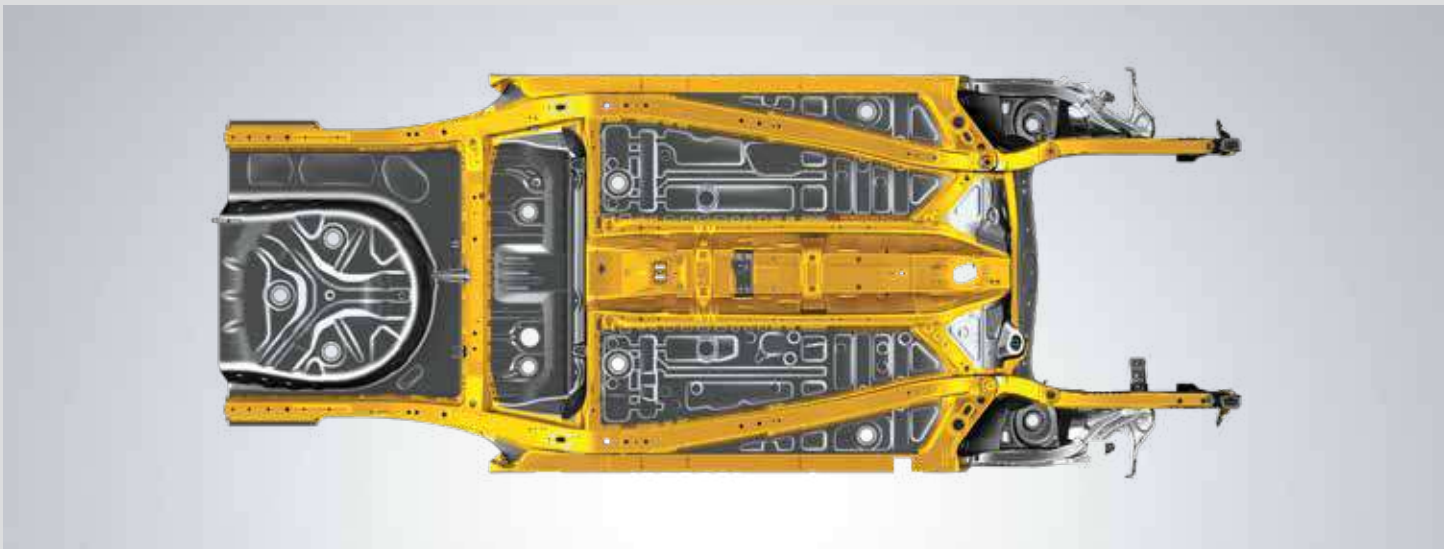
Suzuki HEARTECT Platform Absorbs collision impact, enhances safety

The Dzire comes equipped with features that take care of the safety of all the passengers.