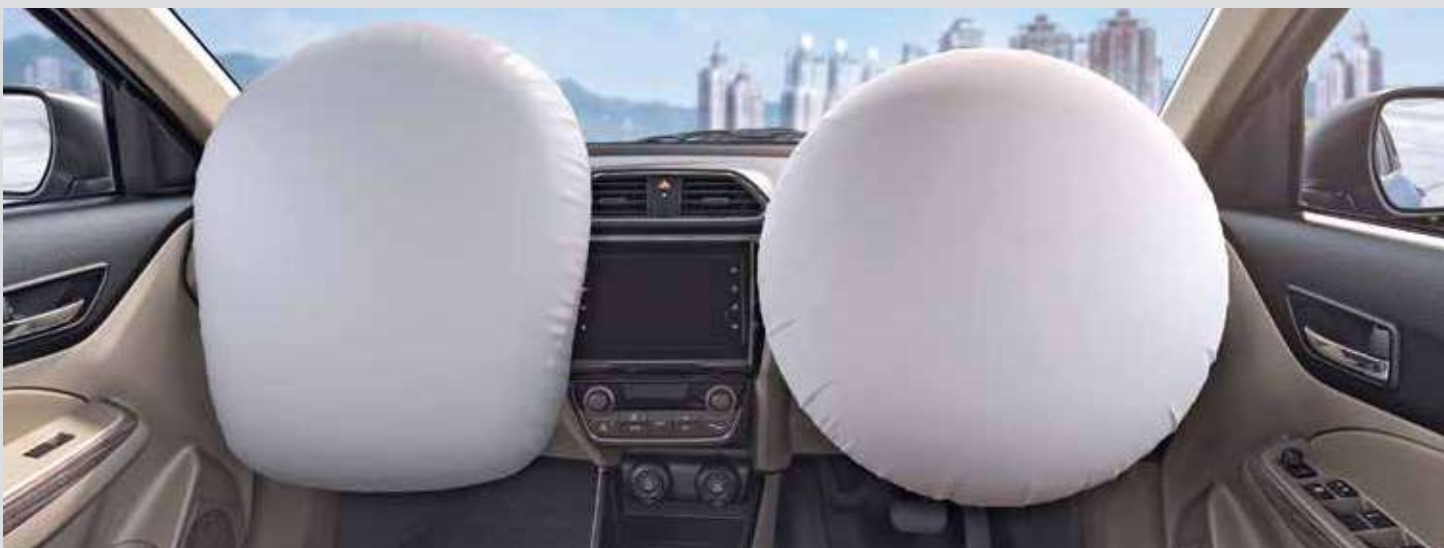
Dual Airbags That are standard across all variants