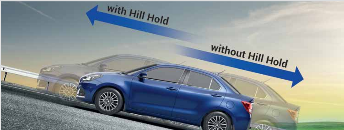
Electronic Stability Program with Hill-hold Assist* So that the drive remains smooth, even on inclined surfaces